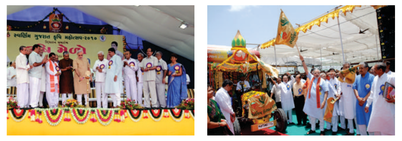
Hon'ble Chief Minister of Gujarat, Shri Narendra Modi, Inaugurating Swarnim Gujarat Krushi Mahotsav-2010

agriculture. The sincere efforts made by the university brought fruitful results which ultimately benefited the farmers of this region.