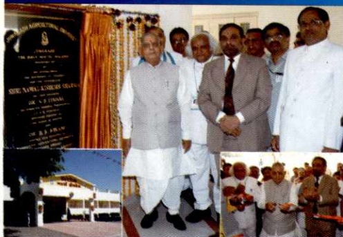
Shri Nawal Kishore Sharma, H.E. Inaugurating girls Hostel Building